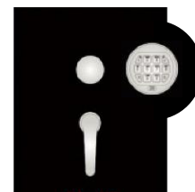
PRO 100D Digital Lock + Key