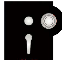
PRO 100M Manual Lock + Key